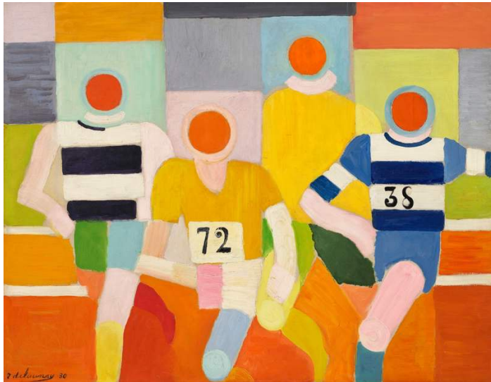
Robert Delaunay, Les Coureurs, 1930, Private Collection